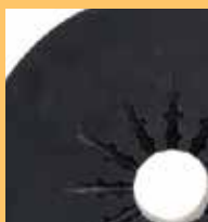
5 gal (20 l)