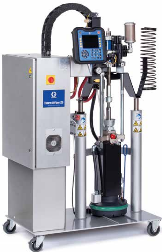
Therm-O-Flow 20 (5 gal)